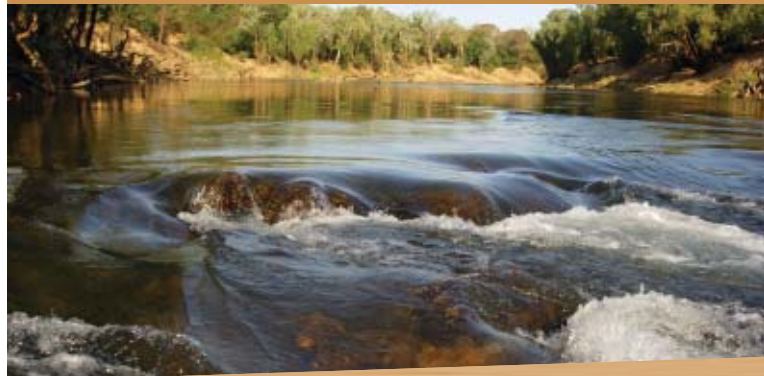
The Daly River, NT – an example of a stream with stable summer baseflow in a TRaCK focus catchment.