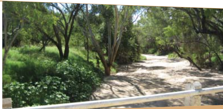
The Flinders River, Qld – an example of a predictable summer highly intermittent stream in a TRaCK focus catchment.

Streams with stable baseflows keep flowing during the dry season. Constant river flows come because of groundwater inputs during the dry season. Examples are found in the Daly and Roper Rivers in the NT.