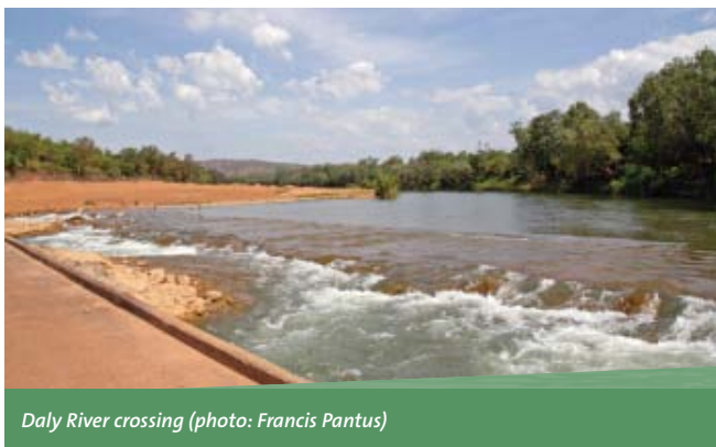
Daly River crossing

By adapting the various models within the MSE tool, we generate management scenarios. For instance: reducing sediment input to rivers increases the available light in the water— how might the algae and fish respond? How might we detect this? Will it help us reach our overall management objectives?