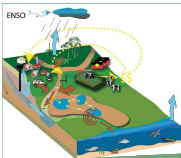
Figure 1: Some of the many connected processes in catchments

Many connected processes – both natural and man-made – occur in catchments. This often makes managing natural resources such as water a complex task. Trying to predict what effect our management actions will have is also difficult because of the many uncertainties involved: how will use of groundwater for irrigation affect river flow? How will fish respond?